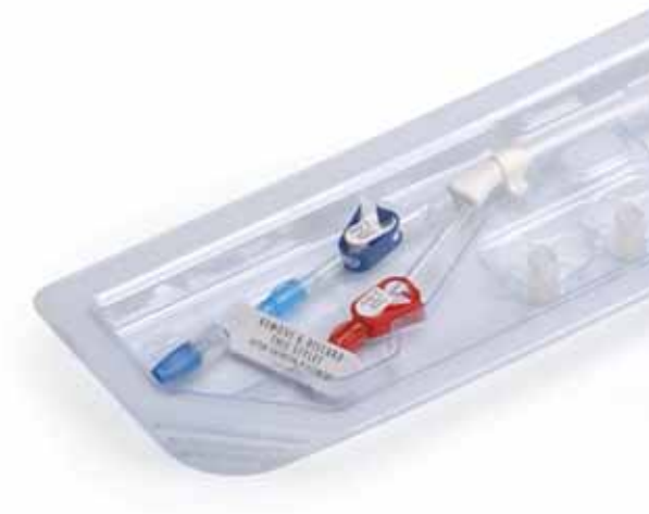
FlowGuard is a trademark of Enpath Medical, Inc.