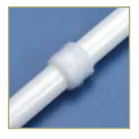
POLYESTER IMPLANTABLE CUFF

Provides a low-profile subcutaneous anchor to minimize the risk of dislodgement