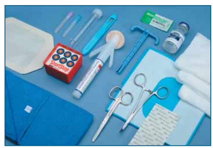
CET200 - Catheter Extraction Kit with OuTake