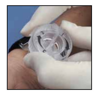
Warning – Patient should not be left unattended while device is in place.

STEP 4. Initial compression should be maintained for a minimum of 30 minutes; however, some patients may require longer initial compression times. Continue to check for bleeding at regular intervals; if bleeding occurs, adjust compression by turning dial clockwise. Note – Use minimum amount of pressure necessary to achieve hemostasis.