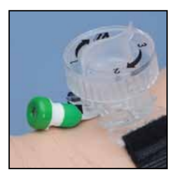
VELCRO® is a registered trademark of Velcro Industries B.V.

STEP 2. Place the device on patient. The compression plate is placed directly over the arterial puncture site. The sheath will be under the compression plate. Loop VELCRO® brand strap through slot; attach and tighten appropriately. Strap should be snug. DO NOT OVER TIGHTEN STRAP.