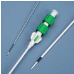
MAK-NV™ Introducer System