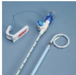
ReSolve® Locking Drainage Catheter