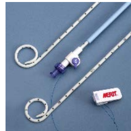
ReSolve® Biliary Locking Drainage Catheter