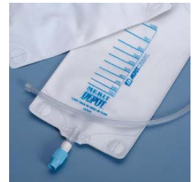
Merit Drainage Depot™ Drainage Bag