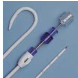
ReSolve® Non-Locking Drainage Catheter